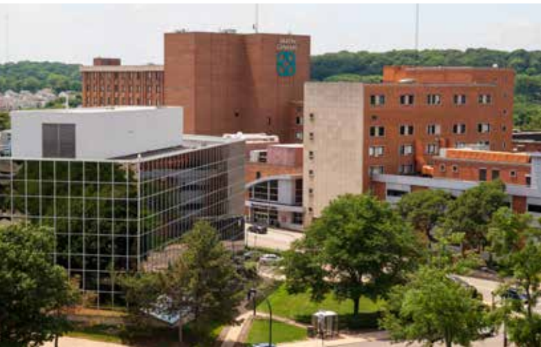
Akron General Health System in Akron, Ohio, USA.