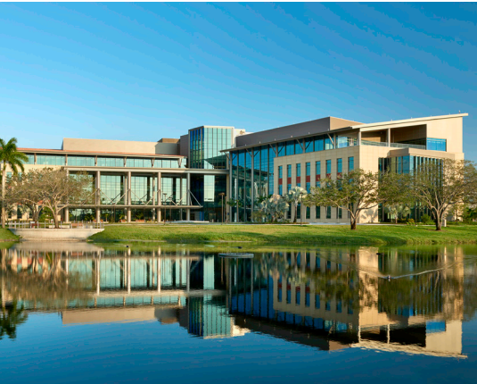
Miami Cancer Institute, Florida, US

Miami Cancer Institute , a part of Baptist Health South Florida, is a state-of-the-art center that serves as the primary destination for patients from the Southeast US, the Caribbean and Latin America. The center is one of a few centers in the world capable of providing all the latest available radiation therapy technologies, and it started treating patients in January 2017. When it was time to determine a treatment planning system that would encompass the various delivery platforms, including proton therapy, RayStation became a natural choice.