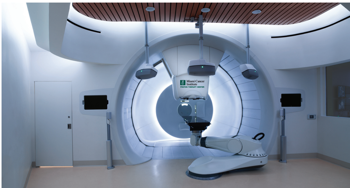
Proton therapy center, gantry treatment room at Miami Cancer Institute.

RayStation's functionality and speed were key factors in the decision to choose RayStation, says McKenzie. "RayStation gives us the best results in planning and evaluation, and does it fast", he says.