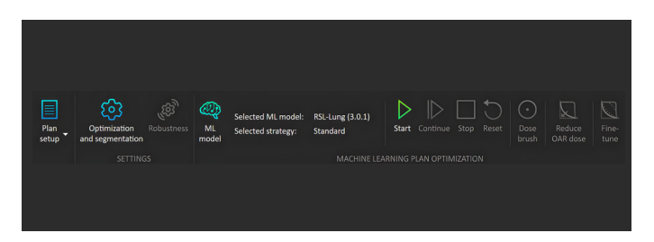
Figure 1. RayStation<sup>®</sup> deep learning planning interface.

Designed to comply with data privacy standards, our pre-trained models do not incorporate any patient images and operate entirely on-site, ensuring that patient information remains confidential and secure within the facility.